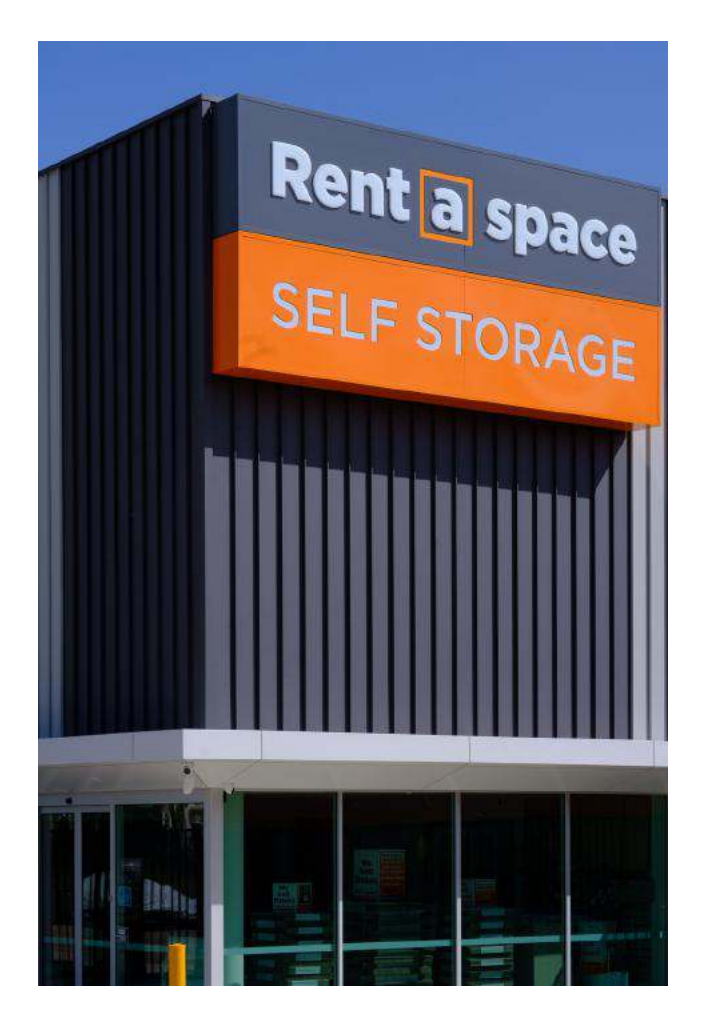
Snap-Line 45® x 305mm Matt Basalt® & Matt Shale Grey®