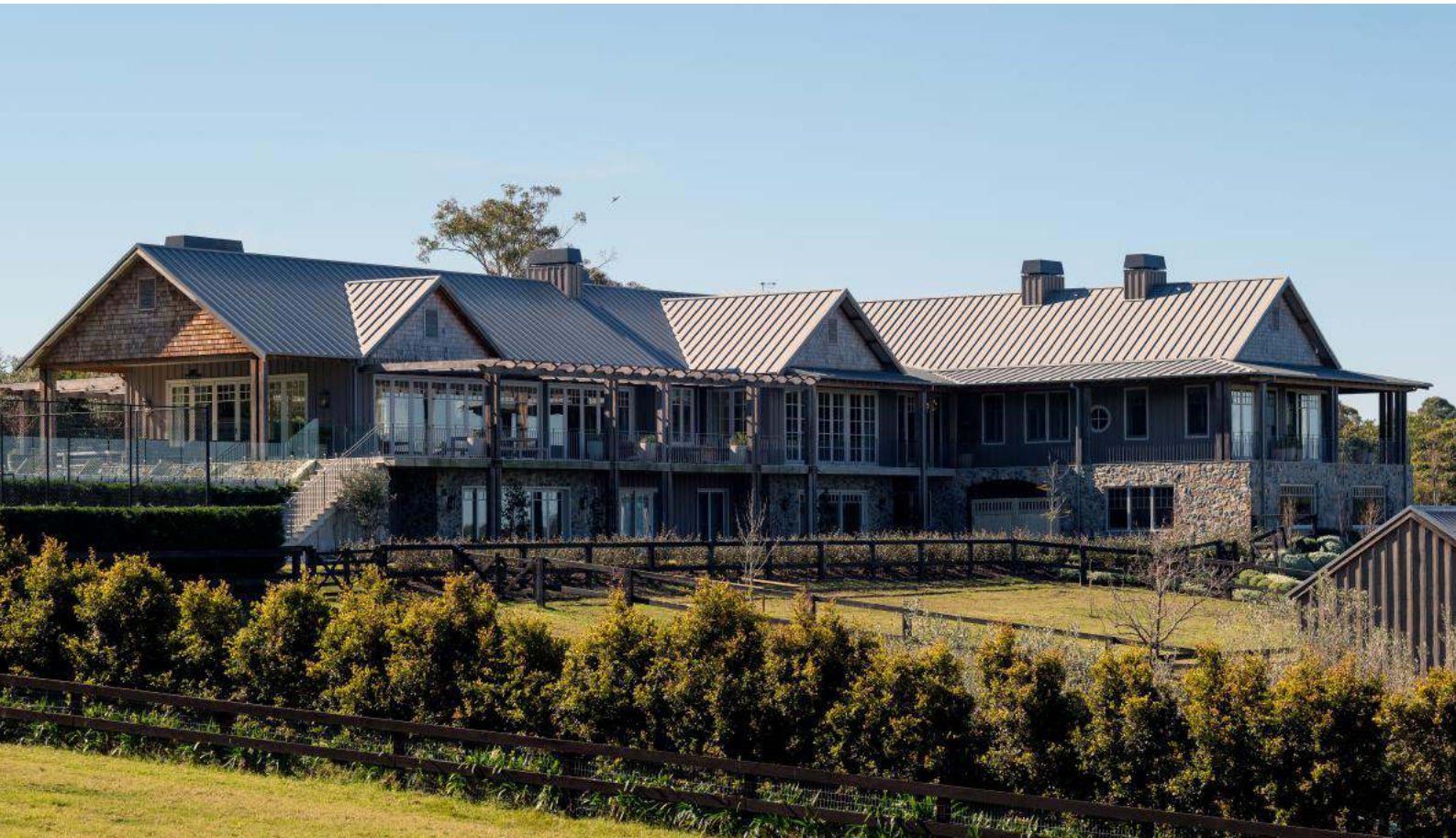
Snap-Line 45® x 445 Windspray®