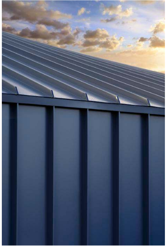
Snap-Line 45® x 345mm Basalt®

*Softer metals such as Zinc and Copper will require continuous substrate backing under the sheet.