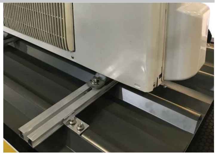
Use this detail with profiles such as TRIMDEK®