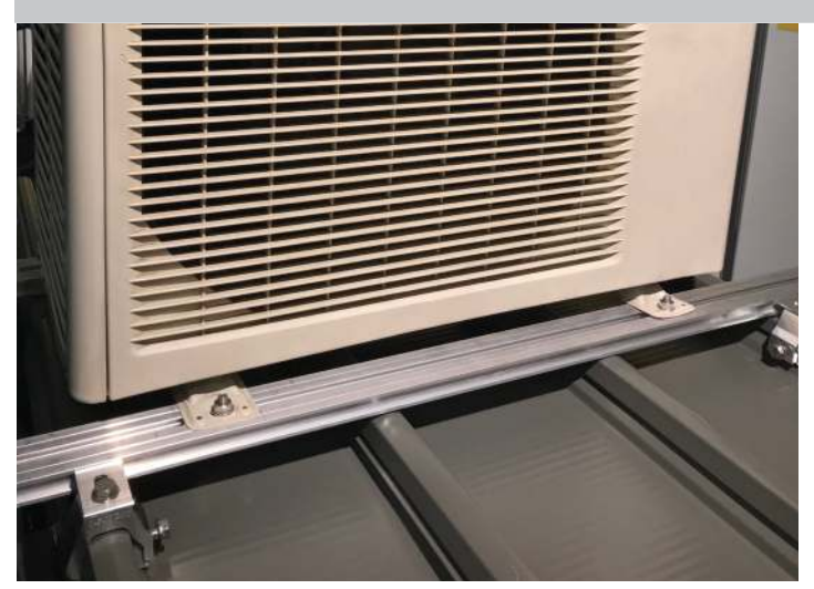
Use this detail for profiles such as KLIP-LOK®, Speed Deck Ultra®