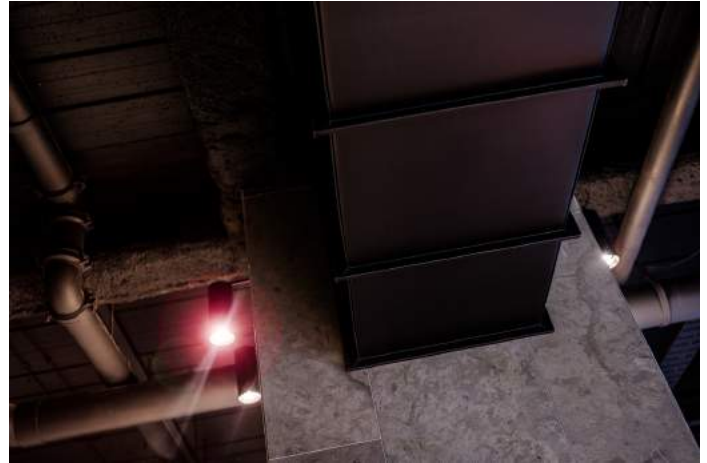
Standing Seam VMZinc™ Anthra